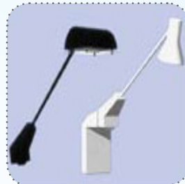
Halogen spot lights 150 W