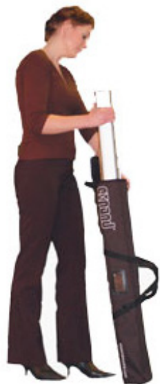
Carry case included