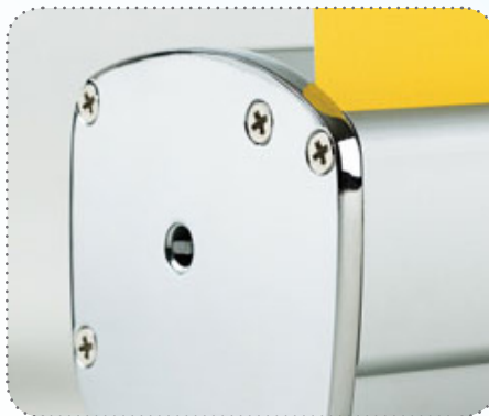
Side side, graphics exchangeable