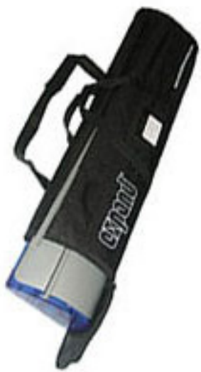
Carry case is included