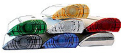
Side pieces in different colours