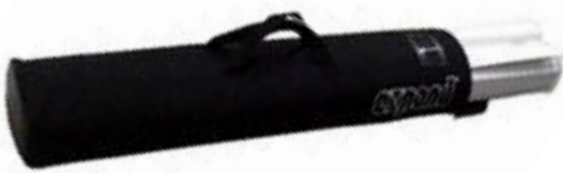
Carry case included