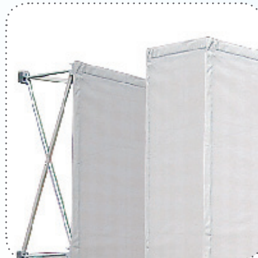
System available with or without side hoods