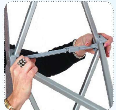
Easy assembly due to lock-in system