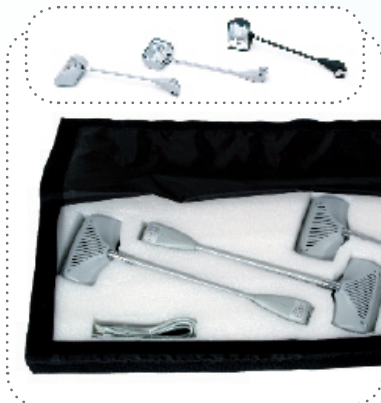
Lighting available in grey or black + bag