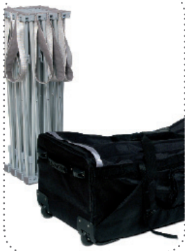
Nylon carry bag