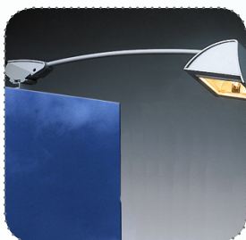
Halogen spot light