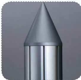
Cone-shaped end cap